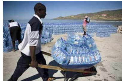
A man carries water bottles donated by the World Food Program in Gonaives, Haiti.

The Pancake Breakfast was a terrific success and NHS extends their gratitude to all who attended! Water jugs are now located in the entrances to the Mansion and Becherer Hall to collect donations. Cash, loose change, and checks (made out to National Honor Society) are greatly appreciated. Please help NHS make a difference in Haiti!